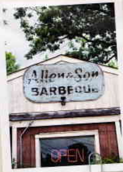
Allen & Son Barbecue