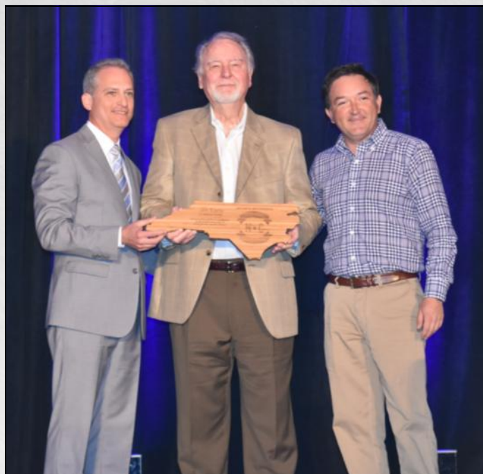
Some of the past recipients are:

and continuing contributions to the growth and success of North Carolina's tourism industry. The award is given annually, and is presented at the Visit NC 365 Conference on Tourism, the largest gathering of the state's tourism industry leaders.